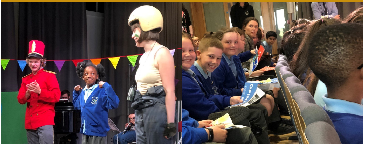
Year 4 - Opera at Sacred Heart High School