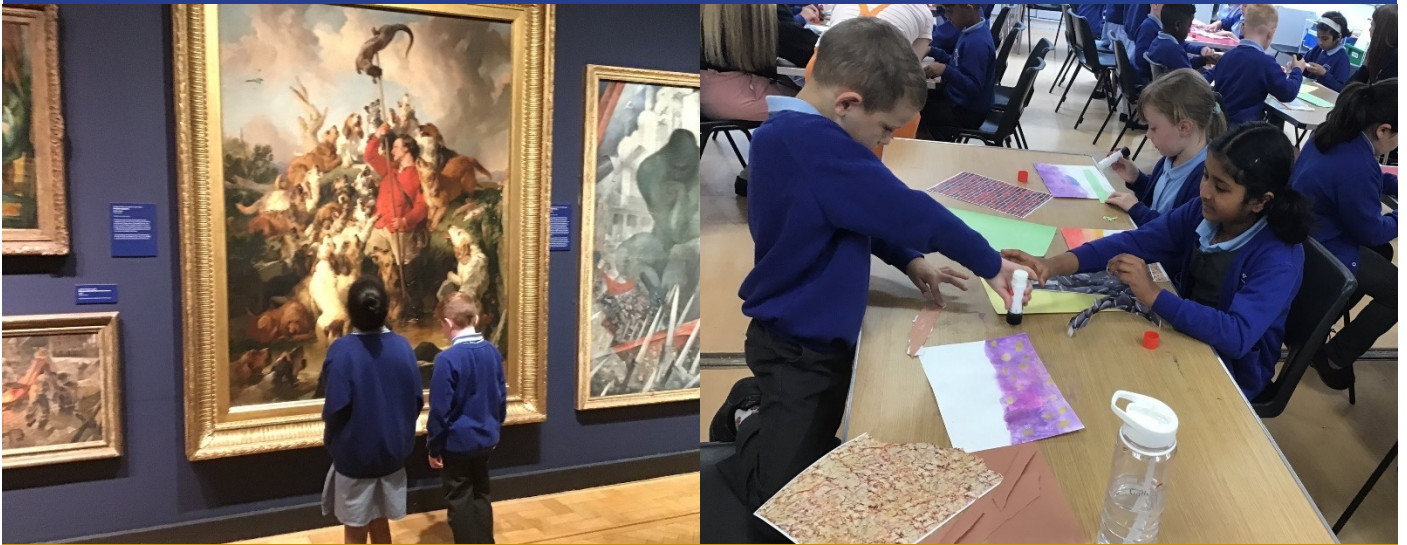
Year 3 - Laing Art Gallery