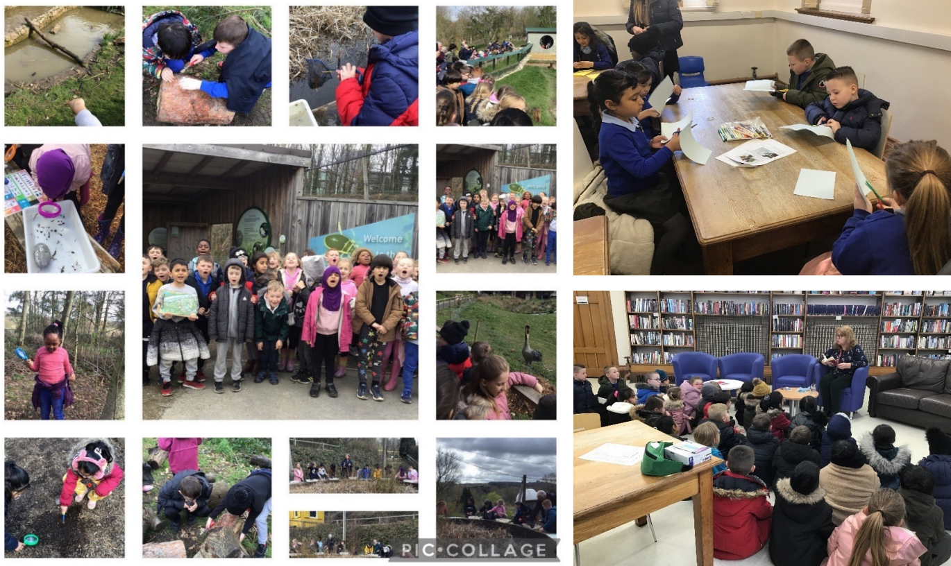
Year 2 - Washington Wildfowl Park and Fenham Library