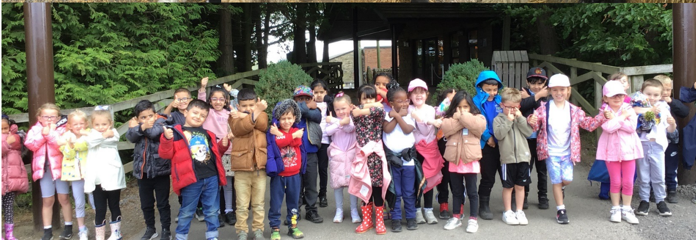
Reception - Hall Hill Farm