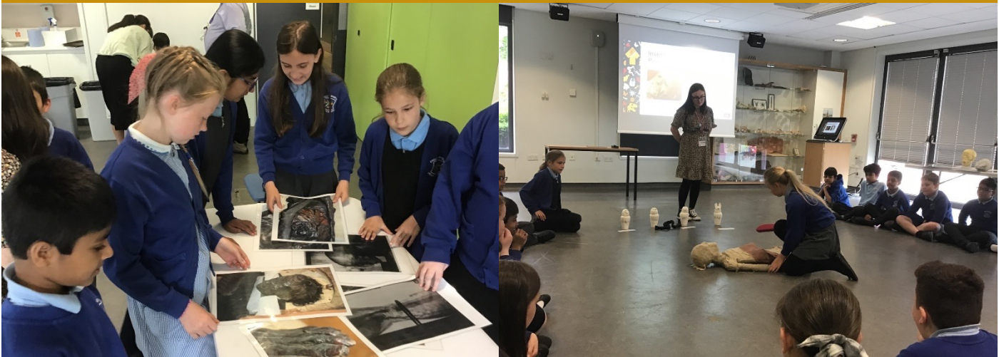
Year 5 - Great North Museum