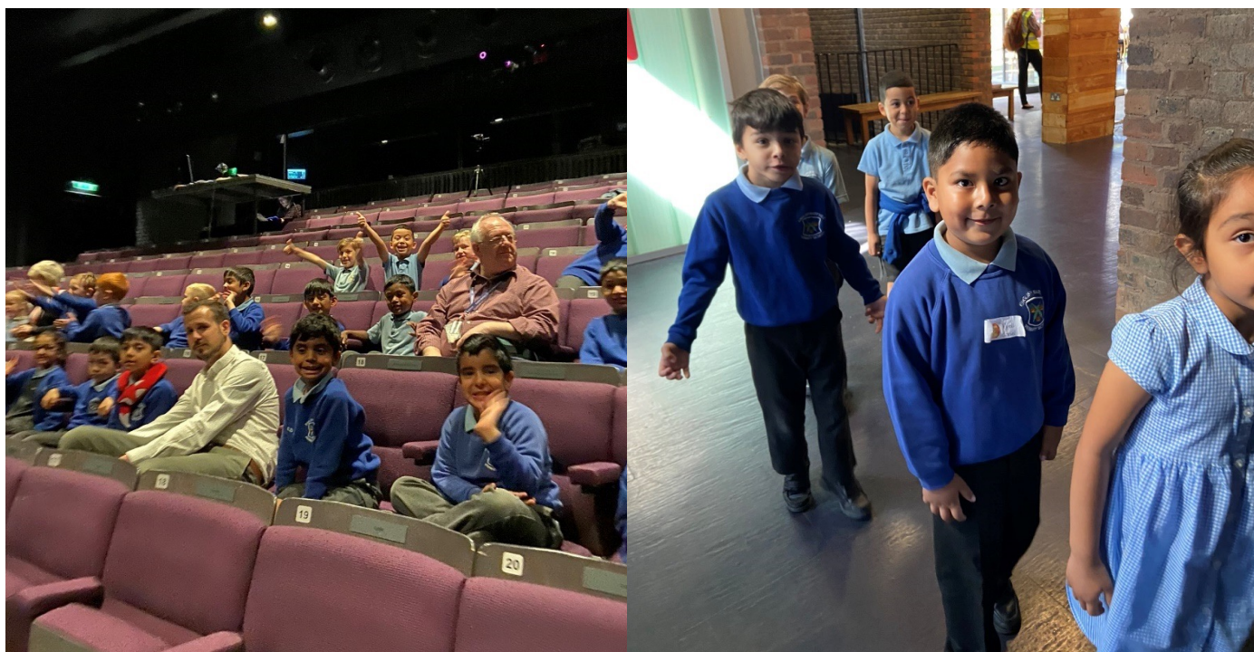
Year 1 - Northern Stage