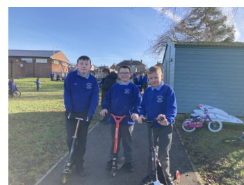
Some of our Y6 Opal Prefects