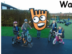
Walk to School mascot 'Strider'