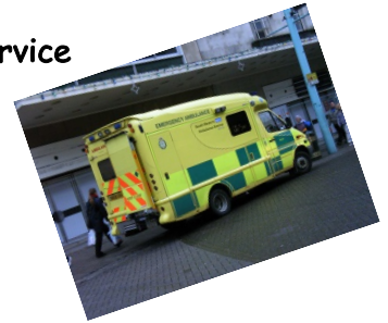
The Ambulance Service