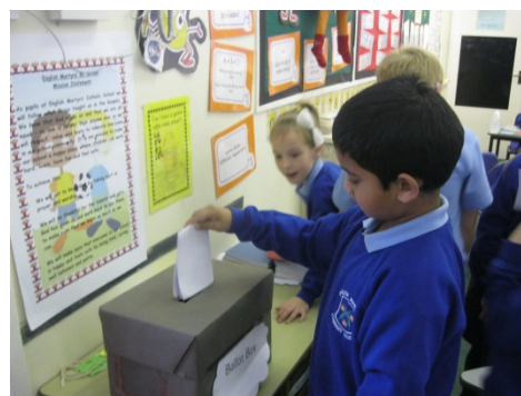
Our School Council Ballot