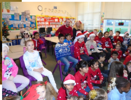
Christmas Jumper Day