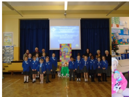
Mini - Vinnies