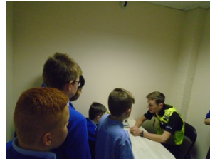
The Police Service